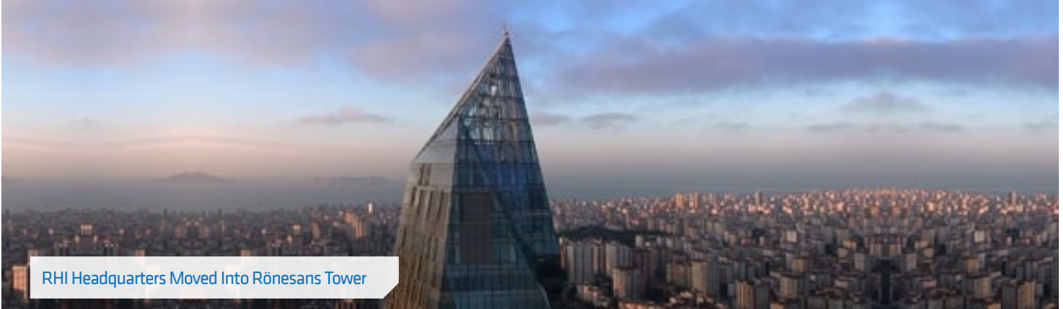
RHI Headquarters Moved Into Rönesans Tower